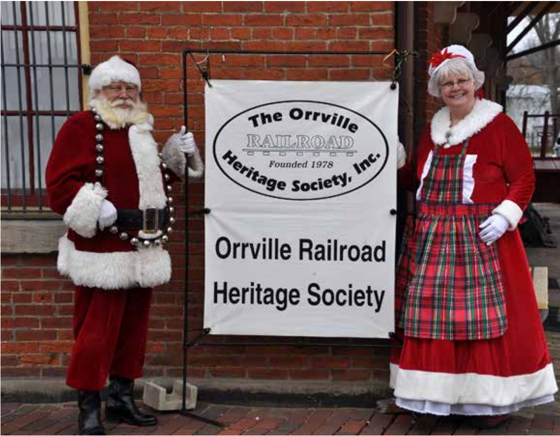
Mr. & Mrs. S. Claus visited ORHS during Holidays at the Depot on November 26.