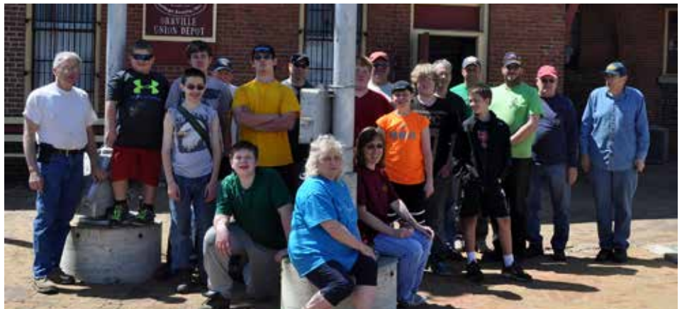
Members of Boy Scout Troop #60 after their day of community service.

As part of their 2016 Spring Camporee, Orrville Boy Scout Troop #60 donated their helping hands as part of their community service project on April 16. Their activities included applying sand to the bricks around the Depot, piling the extra bricks for storage and exposing the concrete curb from the long gone passenger platform along the NS tracks. Thanks for your much appreciated effort!