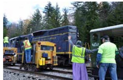
Waiting on a passing Durbin & Greenbrier freight