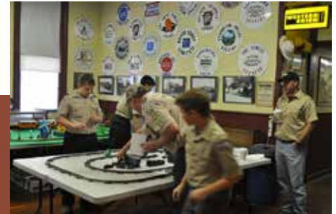
Members of Boy Scout Troop #60 and the "Graveyard Express".