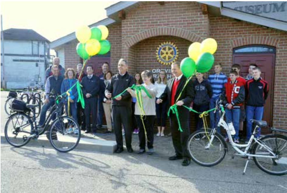
Cutting the ribbon at the new Orrville trailhead.