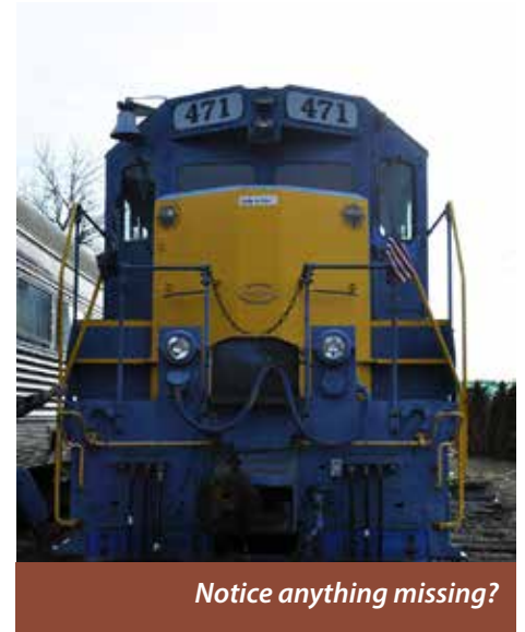
Notice anything missing?

We look to a better season next year as the cleanup and weed control will help us out so we can at least run track cars and go from there. We will see what the future will bring but we'll need help from all the membership to make things work at our new rail yard location. If you'd like to volunteer, please call the Depot.