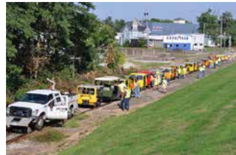
Ready to go in Ashland, Ohio.