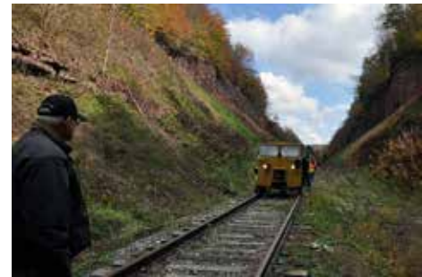
Pausing at Big Cut on Cheat Mountain